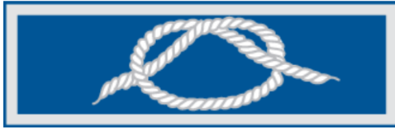
DIVISION AWARD OF MERIT