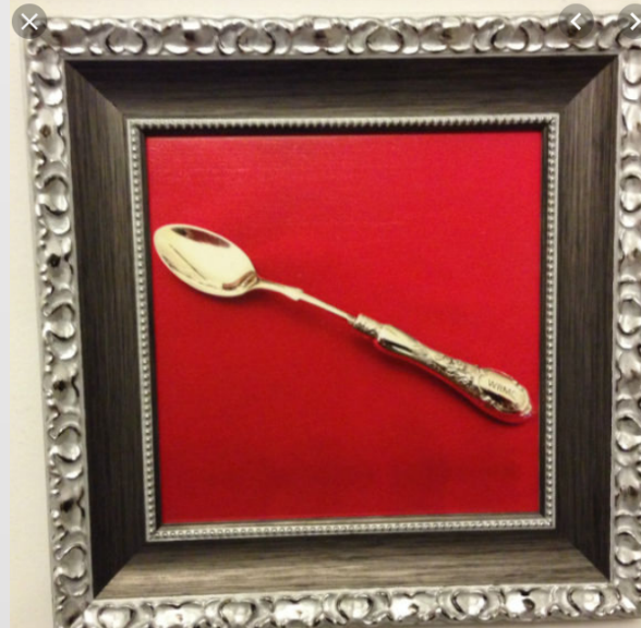
Silver Spoon Award