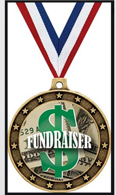
Fund Raiser Award