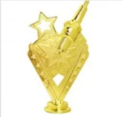
Spark Plug Award