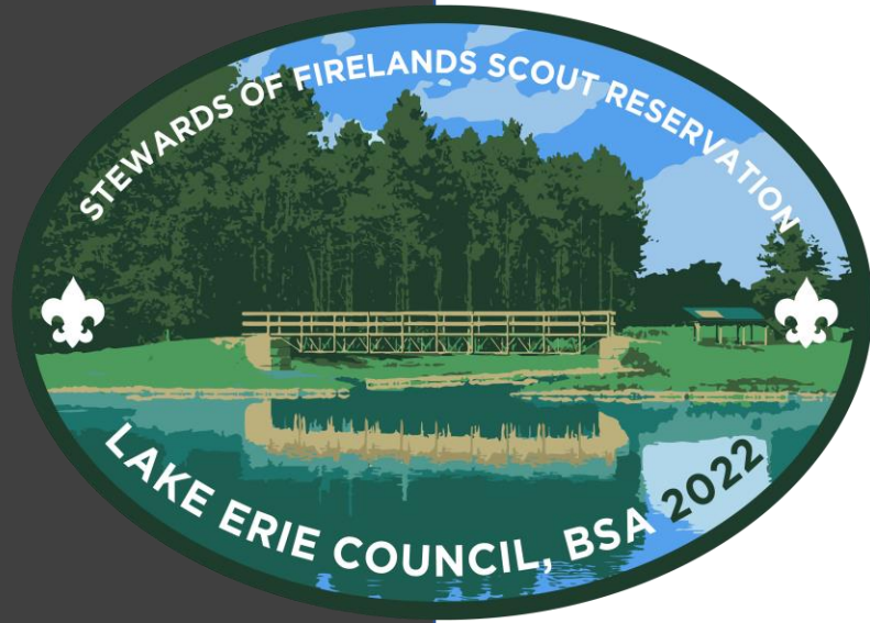
Lion's shelter roof